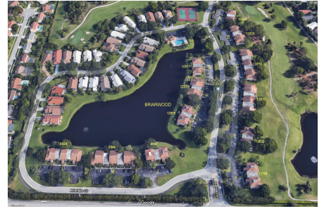
Built in 1982/1989 - 112 units - 2 floors

Briarwood Condominium Association Address: 12929 Briarlake Dr, West Palm Beach, FL 33418 Phone: +1 561-775-2002