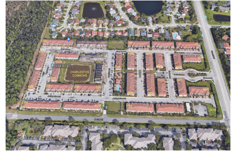
Built in 2014/2017 - 239 units - 2 floors