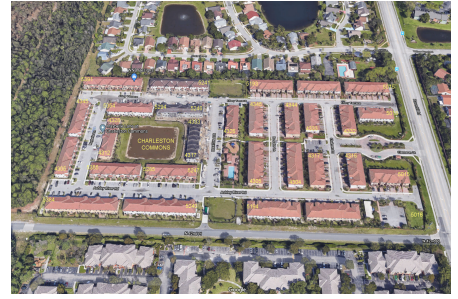
Built in 2014/2017 - 239 units - 2 floors