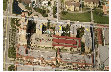
Built in 2000 - 264 units - 5 floors

Number of units: 264 Number of active listings for rent: 5 Number of active listings for sale: 4 Building inventory for sale: 1% Number of sales over the last 12 months: 15 Number of sales over the last 6 months: 4 Number of sales over the last 3 months: 2