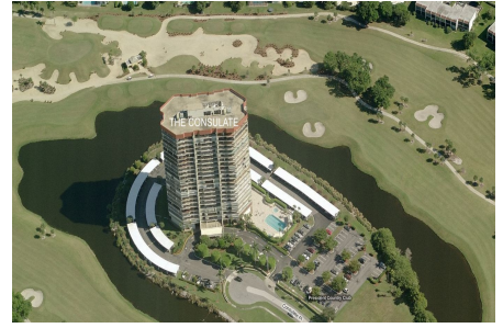
Built in 1980 - 126 units - 22 floors

The Consulate Condominium Association Inc 1900 Consulate Place West Palm Beach, FL33401-1816 (561) 689-7600