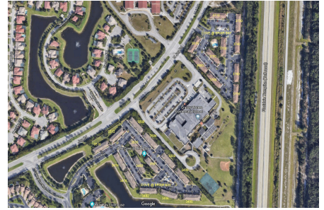
Built in 2004 - 288 units - 2 floors

The Cove @ Briar Bay Address: 3599 Briar Bay Blvd #3401, West Palm Beach, FL 33411 King's Management Services, Inc. 561.627.0480 Office 561.627.1247 Fax Mailing Address: PO Box 32248 Palm Beach Gardens, FL 33420 King's Management Email: mail@kingsmanagement.com https://briarbay.org/