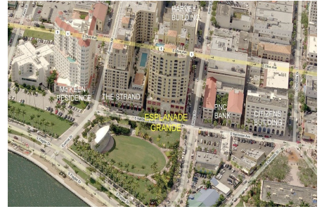
Built in 2004 - 60 units - 16 floors

Condominium Association Management contact 561-832-5130 esplanadegrande@bellsouth.net http://www.esplanadegrande.com