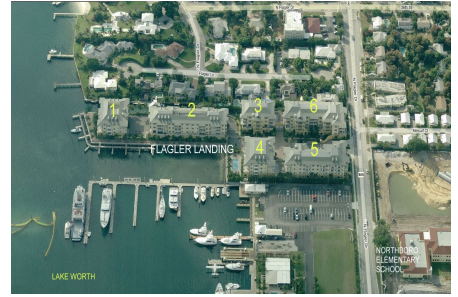
Built in 2007 - 68 units - 4 floors

Flagler Landing Condominium Association, Inc 325 Clematis Street # 100p West Palm Beach, FL33401 (561) 882-4450