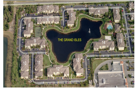
Built in 2005 - 320 units - 3 floors

Grand Isle Apartments 4145 Haverhill Road N West Palm Beach, FL33417-8119 (561) 687-7952 - (561) 687-7912 Gables Grand Isle 4197 Haverhill Road N West Palm Beach, FL33417-8183 (561) 687-7944