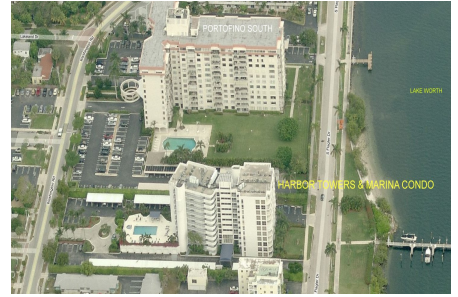
Built in 1986 - 61 units - 11 floors

Harbor Towers & Marina Condo Assoc 3901 S Flagler Drive West Palm Beach, FL33405-2351 (561) 832-2490