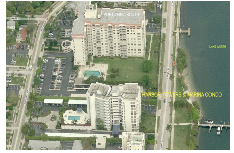
Built in 1986 - 61 units - 11 floors

Harbor Towers & Marina Condo Assoc 3901 S Flagler Drive West Palm Beach, FL33405-2351 (561) 832-2490