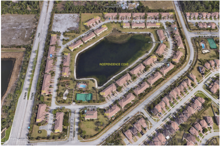
Built in 2005 - 206 units - 2 floors

Independence Address: 1267 Imperial Lake Rd, West Palm Beach, FL 33413 Phone: +1 561-681-1598