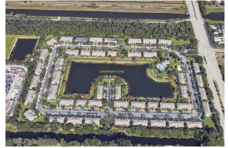
Built in 2002 - 264 units - 2 floors

Jonathan's Cove HOA c/o GRS Community Management 3900 Woodlake Blvd. Suite 309 Lake Worth, FL 33463 TEL: 561-641-8554 FAX: 561-641-9448