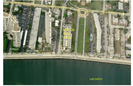
Built in 1985 - 64 units - 9 floors

Norton Park Place Condominium Association, Inc. 1501 S Flagler Dr, West Palm Beach, FL 33401 (561) 659-0117