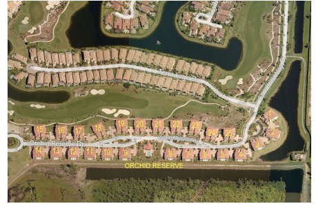
Built in 2005 - 100 units - 2 floors

Number of units: 100 Number of active listings for rent: 0 Number of active listings for sale: 0 Building inventory for sale: Number of sales over the last 12 months: 0% Number of sales over the last 6 months: 1 Number of sales over the last 3 months: 1