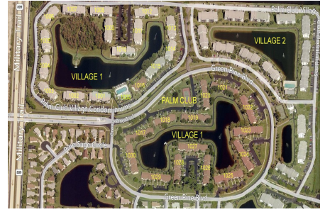
Built in 1984 - 395 units - 3 floors

Palm Club Condominium Assoc 1000 Green Pine Boulevard West Palm Beach, FL33409-7001 (561) 471-1094