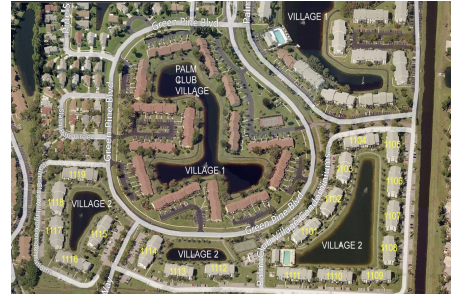
Built in 1984 - 376 units - 3 floors

Palm Club Village II Association Office: 561-689-0993 Company Office: 561-439-1433 http://palmclubwest2.org/