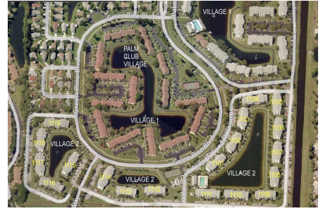
Built in 1984 - 376 units - 3 floors

Palm Club Village II Association Office: 561-689-0993 Company Office: 561-439-1433 http://palmclubwest2.org/