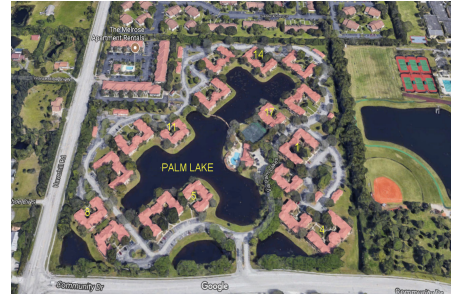
Built in 1991 - 304 units - 2 floors

management office contact 561 478 7205 palmlake@apmanagement.net http://www.atlanticandpacific.net/palmlakecondo/home.asp