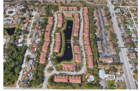
Built in 2006 - 177 units - 2 floors