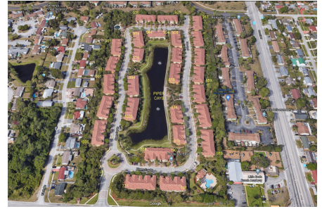
Built in 2006 - 177 units - 2 floors