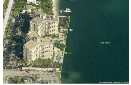
Built in 1969 - 124 units - 10 floors

Portofino Condominium Apartments 2600 N Flagler Dr, West Palm Beach, FL 33407 (561) 655-3391