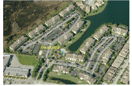
Built in 2006 - 300 units - 3 floors

San Michele Andros Isle 8901 Okeechobee Boulevard West Palm Beach, FL33411-1826 (561) 753-4727