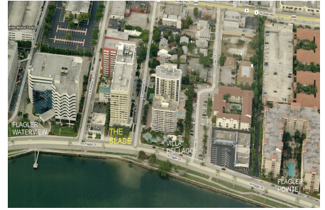
Built in 2005 - 199 units - 16 floors

The Slade Condo Association 561-653-8230