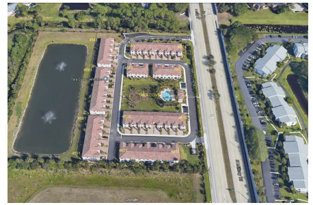
Built in 2017 - 50 units - 2 floors