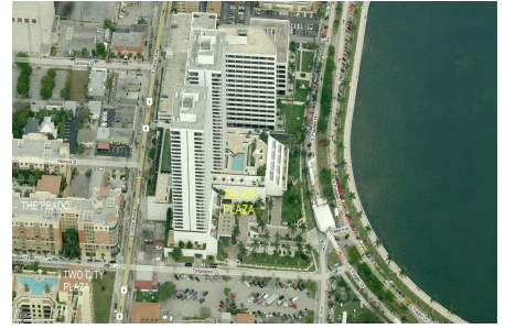
Built in 1986 - 191 units - 32 floors