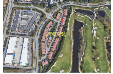
Built in 2007 - 70 units - 2 floors

Ventura Greens At Emerald Dunes Condominium Association, Inc. 2790 Eagle Rock Cir West Palm Beach FL 33411