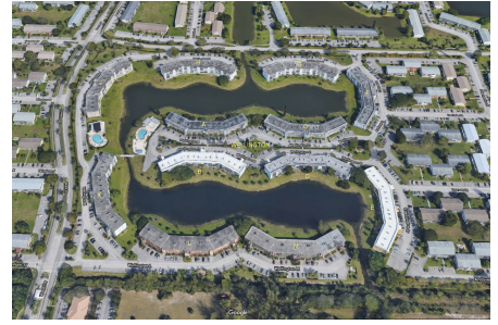
Built in 1971 - 560 units - 4 floors