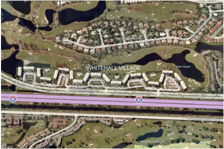
Built in 1985 - 480 units - 4 floors

Whitehall Condominium Of The Village Of Palm Beach Lakes Association 2771 Village Boulevard West Palm Beach, FL33409-6912 (561) 478-3958