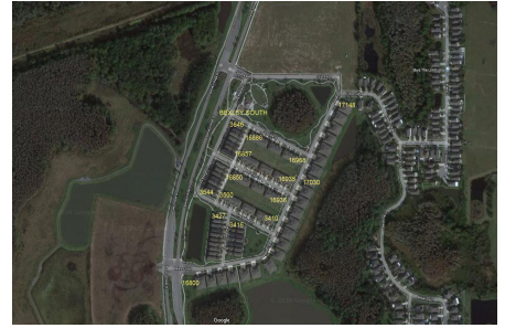
Built in 2018 - 139 units - 2 floors

Bexley by Newland Address: 16950 Vibrant Way, Land O Lakes, FL 34638 Phone: +1 813-425-7555