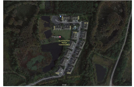
Built in 2005 - 90 units - 2 floors