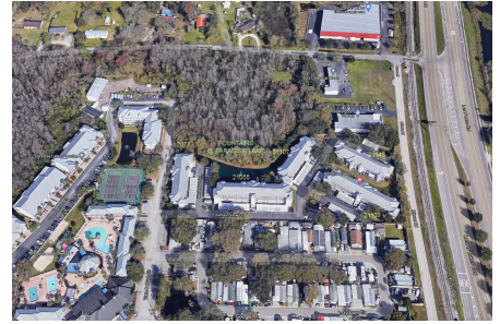
Built in 2002 - 71 units - 4 floors

Paradise Lakes Condominium Association Inc. Address: 1778 Samurai Point, Q-01, Lutz, FL 33558 Phone: +1 813-948-6411