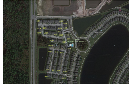
Built in 2015/2018 - 197 units - 2 floors

https://www.longlakeranchhoa.com/contact.php https://www.longlakeranchhoa.com/default.php