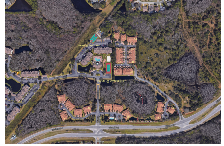
Built in 2005 - 61 units - 2 floors

Master Homeowners Association Resource Property Management 727-796-5900 ext. 2107 https://www.wyndtreemasterhoa.com/