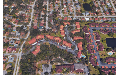
Built in 1981/1987 - 88 units - 2 floors