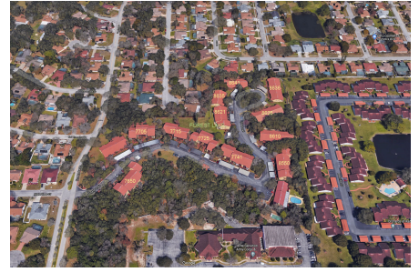
Built in 1981/1987 - 88 units - 2 floors