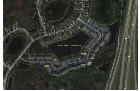
Built in 2006/2013 - 172 units - 2 floors