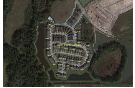
Built in 2016 - 118 units - 2 floors

Wiregrass Community Development District Rizzetta & Company, Inc. 5844 Old Pasco Road Suite 100 Tampa, FL 33544 Ph. 813-994-1001 https://www.wiregrasscdd.org/