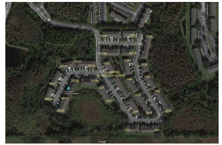
Built in 2005 - 130 units - 2 floors

https://www.meadowpointe2cdd.org/villages http://mymeadowpointehoa.com/