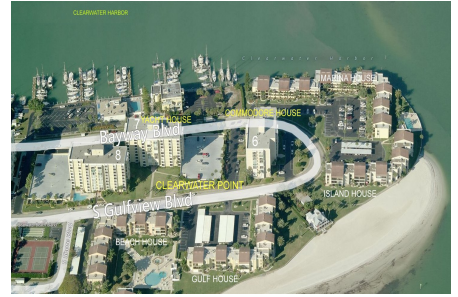
Built in 1974 - 137 units - 9 floors

Clearwater Point No 7 Inc 855 Bayway Blvd Unit C 301 Clearwater, FL 33767 Phone: (727) 442-0664 (727) 443-5941 (727) 441-4640