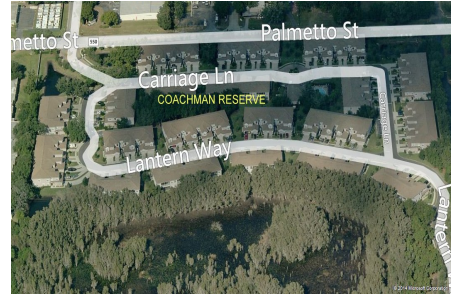
Built in 2007 - 144 units - 2 floors

Coachmen Reserve Condominium 2042 Carriage Ln Clearwater, FL 33765 (727) 443-4079