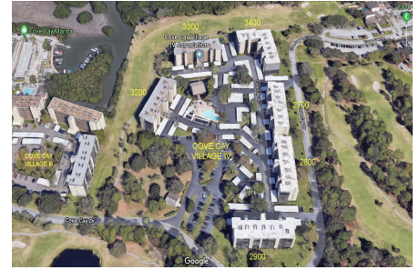
Built in 1982 - 308 units - 7 floors

Cove Cay Village IV Association Address: 3500 Cove Cay Dr, Clearwater, FL 33760 Phone: +1 727-535-5403