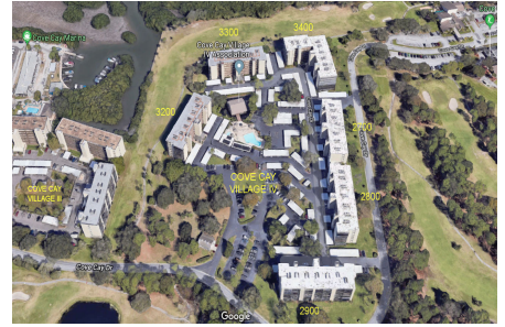
Built in 1982 - 308 units - 7 floors

Cove Cay Village IV Association Address: 3500 Cove Cay Dr, Clearwater, FL 33760 Phone: +1 727-535-5403