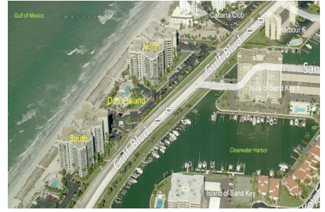
Built in 1982 - 86 units - 12 floors

Dan's Island 1660 Condominium 1660 Gulf Blvd, Clearwater Beach, FL 33767 (727) 596-6083