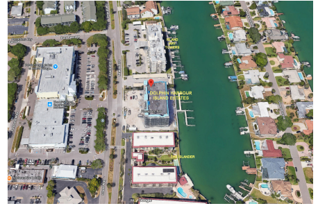
Built in 2023 - 27 units - 7 floors

Number of units: 27 Number of active listings for rent: 0 Number of active listings for sale: 12 Building inventory for sale: 44% Number of sales over the last 12 months: 0 Number of sales over the last 6 months: 0 Number of sales over the last 3 months: 0 Dolphin Harbour Coindominiums 125 Island Way in Island Estates, Clearwater, Florida https://dolphinharbour.com/