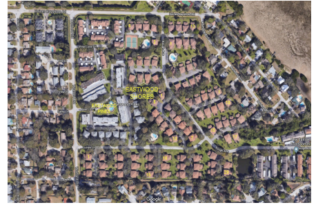
Built in 1979/1986 - 415 units - 2 floors

Eastwood Shores Condominium No 6 Associa 1810 Bough Avenue Clearwater, FL 33760 Phone: (727) 726-8000 https://eastwoodshores4.org/