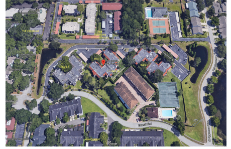
Built in 1982 - 60 units - 2 floors

Estancia Townes Homeowners Association, Inc. Address: 4151 Woodlands Pkwy, Palm Harbor, FL 34685 property manager (727) 773-9542 Ext. 120 estanciatownes@gmail.com http://home.estanciatownes.org/