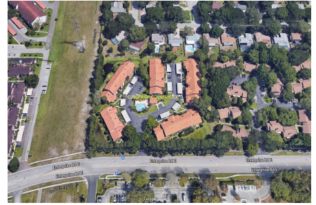
Built in 1984 - 44 units - 2 floors

Europa Of Countryside Condominiums Address: 2620 Enterprise Rd E, Clearwater, FL 33759