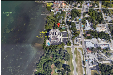
Built in 1974 - 78 units - 3 floors