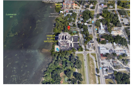
Built in 1974 - 78 units - 3 floors