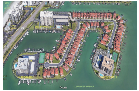
Built in 1982 - 128 units - 8 floors

Number of units: 128 Number of active listings for rent: 2 Number of active listings for sale: 3 Building inventory for sale: 2% Number of sales over the last 12 months: 5 Number of sales over the last 6 months: 3 Number of sales over the last 3 months: 3