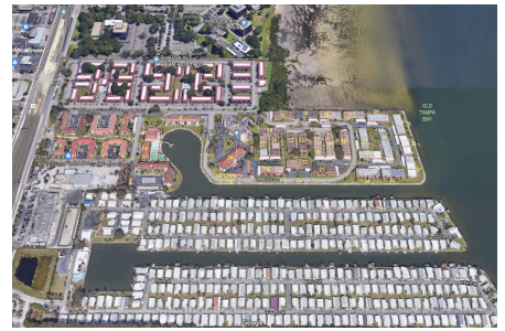
Built in 1969/1979 - 447 units - 7 floors

Imperial Cove/Assoc 19029 US Highway 19 N, Clearwater, FL 33764 (727) 531-3016 Imperial Cove Condos Association Address 1303 S Hercules Ave Clearwater, Florida 33764 Phone +1 727-531-1679