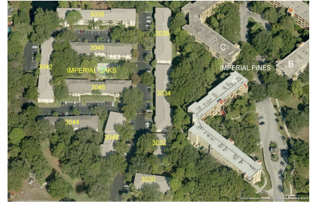
Built in 1980 - 166 units - 2 floors