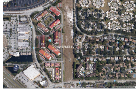
Built in 1980/1985 - 365 units - 4 floors

Inverness Condominium Rec Center 2589 Countryside Blvd Clearwater, FL 33761 727-723-3275 727-724-9101