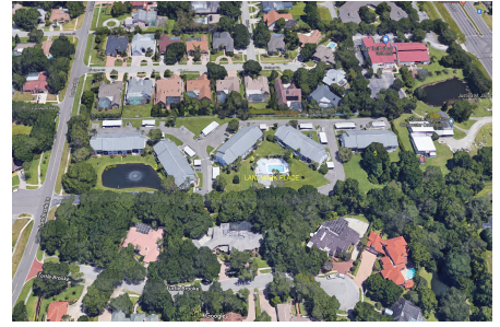
Built in 1984/1988 - 50 units - 2 floors

Number of units: 50 Number of active listings for rent: 0 Number of active listings for sale: 0 Building inventory for sale: Number of sales over the last 12 months: 0% Number of sales over the last 6 months: 0 Number of sales over the last 3 months: 0