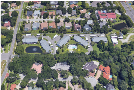
Built in 1984/1988 - 50 units - 2 floors