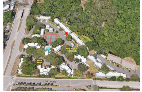
Built in 1983/1988 - 32 units - 1 floor