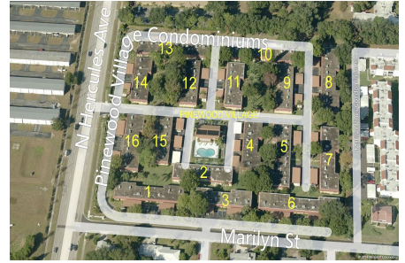
Built in 1978 - 111 units - 1 floor

PINEWOOD VILLAGE CONDOMINIUM ASSOCIATION, INC. HOLIDAY ISLES PROPERTY MANAGEMENT INC 11350 66TH ST STE 124 LARGO FL 33773 727-548-9402